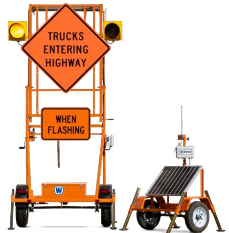
Expandable system easily incorporates into ITS applications such as TWS and Queue Detection Warning